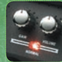
Gain Control On Normal Channel The TBX features a Gain control on the Normal Channel to offer wider tonal variation ranging from pure clean tones to crunchy overdrive.