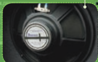
IS Speaker driver Extremely efficient Ibanez IS speaker drivers are voiced for tight and focused low-end for today's modern music styles.