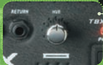
HUE Control Adjusts overall tonal character. (TBX150H/150R)