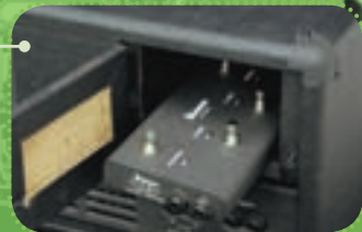
TB150H Accessory Storage Allows convenient storage of footswitches, cables or accessories.