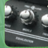
Parametric MID EQ Control Midrange is a very important aspect in determining the character of an amplifier's sound. The TBX active Parametric Mid control allows you to shape a wide variety of distortion tones and amp sounds. This control also works for the Normal channel on the TBX15R and TBX30R.