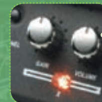
X Mode/Channel The X mode/channel emphasizes tighter low end and a unique tonality in the midrange, which increases sustain and harmonics.