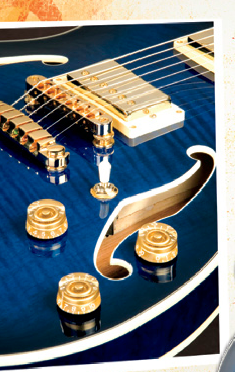
Classic gold hardware and Blue Sunburst finish make for a stunning combination.