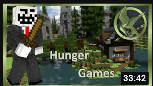
Hunger Games 273 - The Turtle Challenge V2