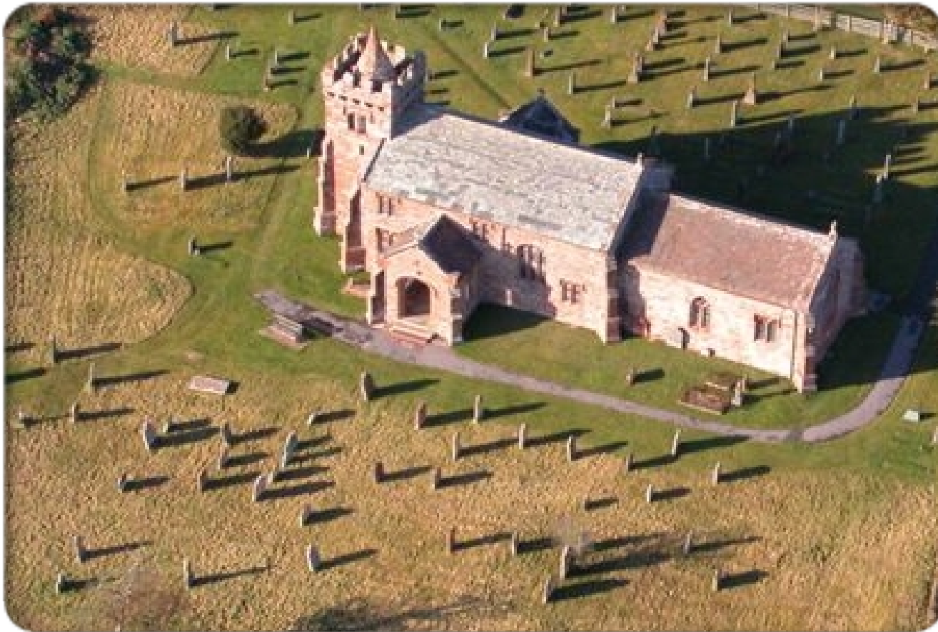
The Parish Church in Preston. St. Wilfred's is a charming church dating back to the 7th century.