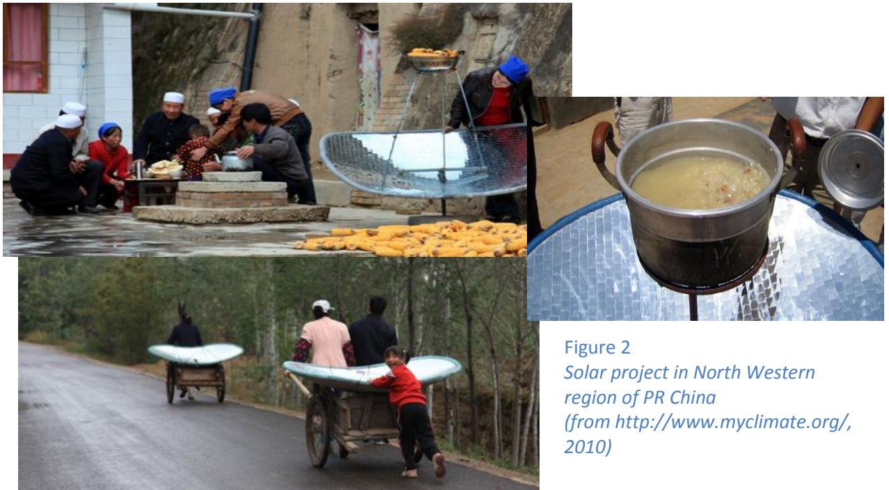
Figure 2 Solar project in North Western region of PR China (from http://www.myclimate.org/ , 2010)

In addition to the documented adoption of the technology, participant feedback has been positive. Coal-dependent households with an average energy consumption of 1345 kgce 7 per annum spend between 5 and 25% of their income on fuel (Gregory 2012, Jiang, 2004). Zhang Binglian, a farmer in Pengyang County, has a greatly reduced fuel bill and considers the solar cooker a “ real blessing ”. (Tianbi, 2011) Less money and time spent on cooking and cleaning blackened pots, mainly done by women, has allowed time and funds for other activities, such as tea growing, allowing for some income earning. The solar cooking projects have directly created jobs in product manufacturing, servicing, distribution, demonstration and monitoring of usage.