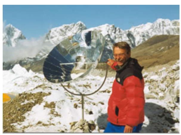
Fig.7 Parabolic "Sagarmatha" solar cooker at Everest base camp (made by FAST)

- I designed a powerful, collapsible, lightweight (3.5 kg) parabolic solar cooker for trekking agencies and households. In the year 2000, I installed this 1-meter diameter cooker at Everest Base Camp for use of the Everest 2000 Environmental Clean-up Expedition (fig.7). If trekking groups and expeditions would use solar and heat-retaining technologies, they would automatically disseminate solar cooking, providing a nice multiplier effect. Bringing lightweight collapsible parabolic cookers to households in remote villages reduces transportation costs. My design has been made available for free to reputable Nepalese organizations.