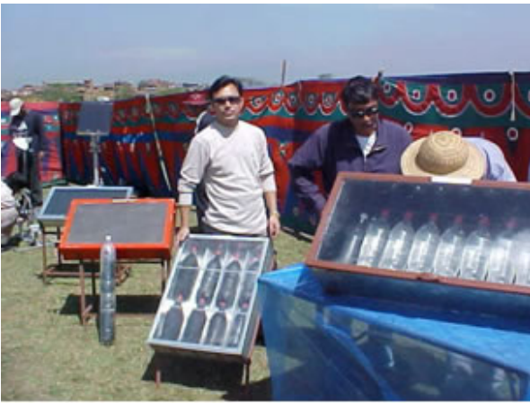
Fig.3 Water Pasteurizers - different types by FoST