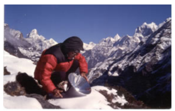
Fig.4 Solar Backpack "Trekkers" Cooker (made by FAST) preparing food or melting snow for drinking

I designed this roll-up backpack cooker to be fast and effective in demonstrating solar cooking in remote and rural areas as well as in the cities. Because of its light weight and small size, I always carry it with me, just in case the right opportunity presents itself to discuss solar or to use it (fig.4, 5, 6). It pasteurizes a beverage can-size pot of water, or prepares soup or tea in 20 minutes. Rice takes 35 minutes to cook.