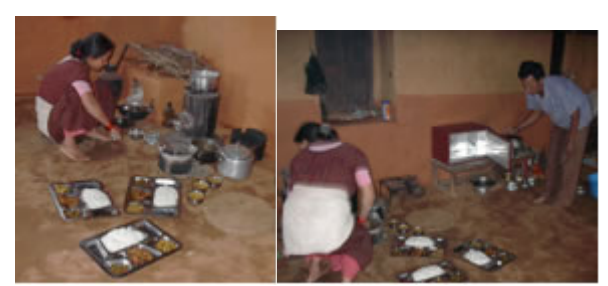
Fig.8 Rocket stove Fig.9 Heat-retention box both used in rural villages

When there is not enough sun to solar cook, it is important to have an alternative, environment-friendly cooking solution that is healthy, minimizes smoke, and saves fuelwood, kerosene, gas or electricity. Therefore I now follow an INTEGRATED approach to solar cooking and water pasteurization, adding very efficient, almost smokeless, fuelwood cookstoves to the solar programs for greater success. These so-called "Rocket stoves" have been developed by Approvecho NGO in the USA. Rocket stoves in combination with heat-retaining boxes (Fig.8, 9) reduce fuelwood consumption by more than 50 percent compared to traditional stoves. Only 3 twigs of wood are needed to cook a meal for a typical family. One has to slowly feed the wood into the stove. Using a "skirt" around the pot increases the efficiency even more by guiding the hot flue gases between pot and skirt.