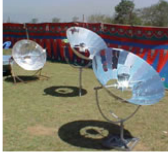
Fig. 10, 11, 12 Handing out solar and sustainable devices of Rotary Matching Grant projects

Where possible, beneficiaries pay 15 percent of device costs to show a real commitment. Some projects also have an educational component of teaching schools how to make and use simple panel cookers. Another includes making bio-mass briquettes for fuel from any waste material (grass clippings, shredded leaves, newspapers, cardboard) in hand-operated presses. Briquette programs empower women to become microentrepreneurs selling briquettes for use in efficient stoves. I selected FoST as the primary organization responsible for training of the villagers, fabricating the devices and coordinating with Village Development Committees and Rotary. When I am not in Nepal, we communicate through e-mail.