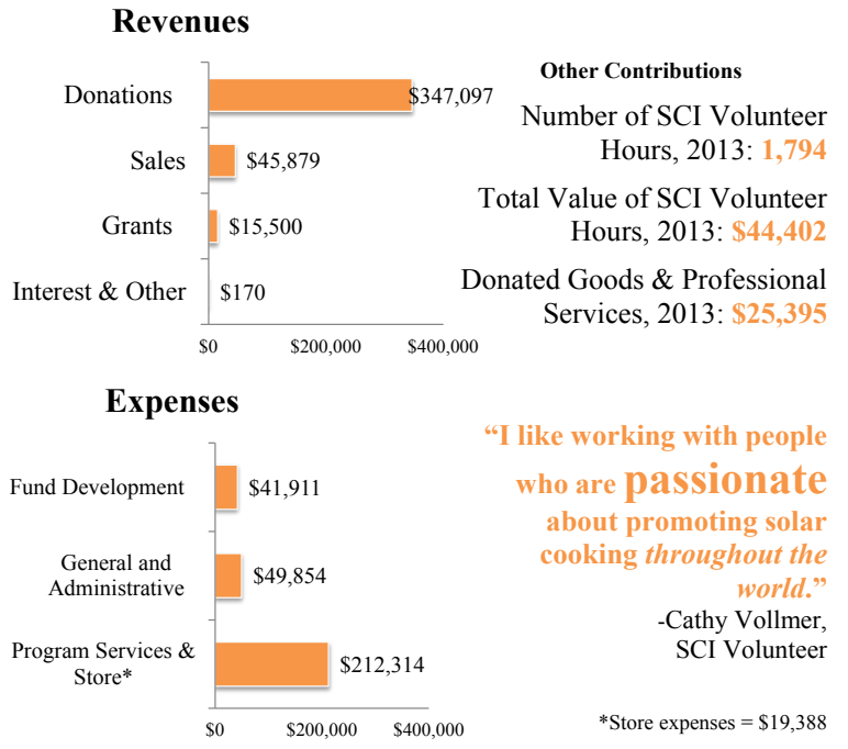
To see Annual Reports visit www.solarcookers.org