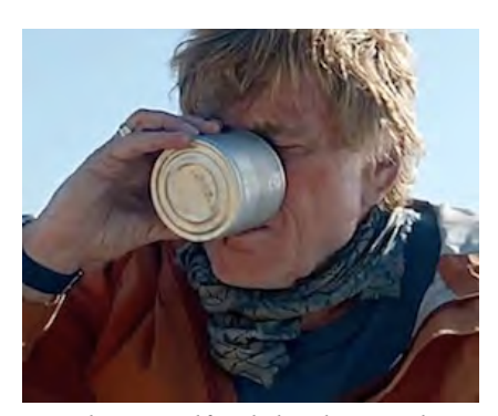
Robert Redford drinking solar distilled seawater in "All is Lost", Lions Gate/Roadside Attractions 2013

My fictional war memoir, <u>Farishta</u>, which includes the use of solar cookers by Afghan refugee