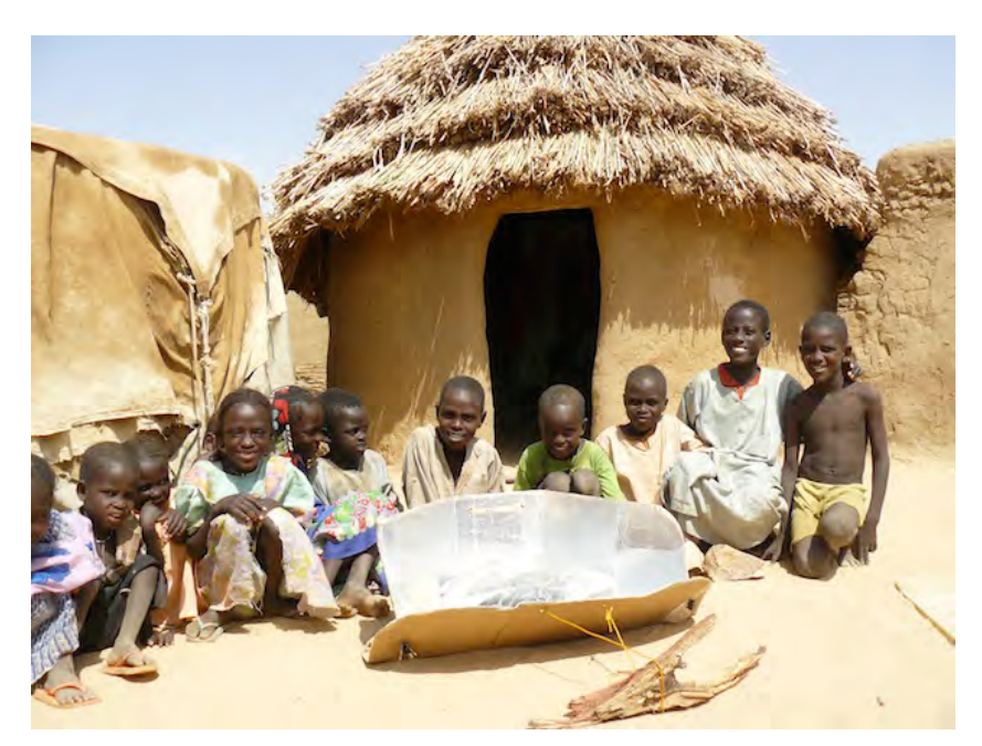
Important memories — Darfur refugee children with a CooKit, Iridimi camp, eastern Chad.

Give this issue of the Solar Cooker Review to a friend. Leave it at a doctor or dentist's office, or in a bus terminal or airport lounge so more people can learn about the fascinating world of solar cooking.