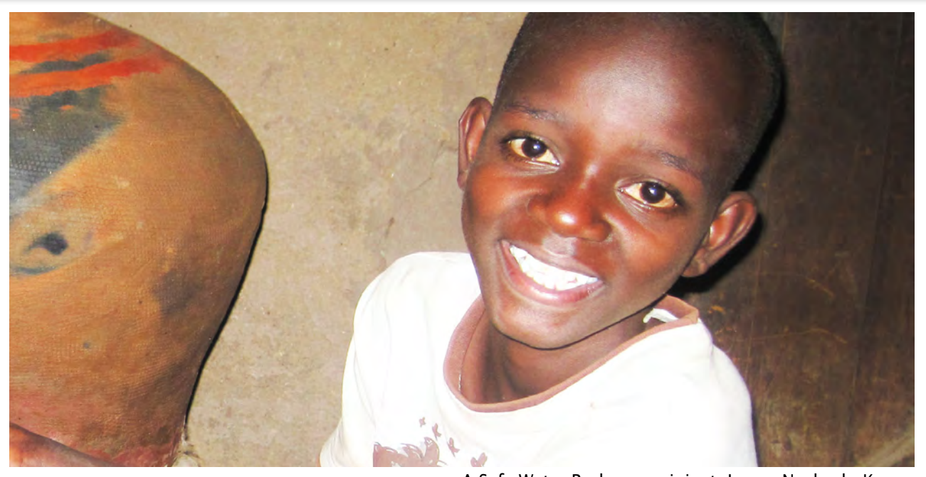
we could not do it without you