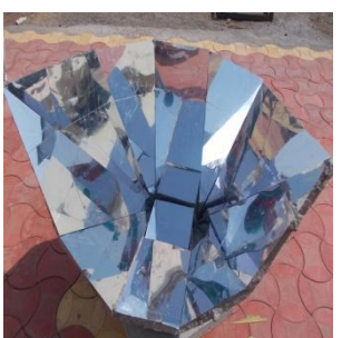
Simple construction, appropriate technology