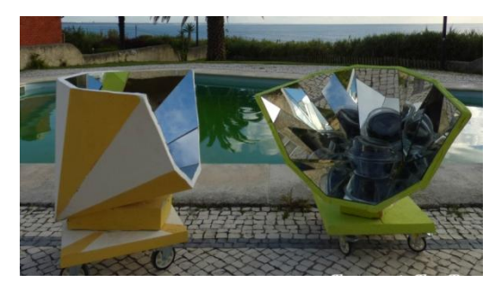
Embellished concrete funnel cookers

Some feedback of Indian family about use of the concrete funnel cooker: