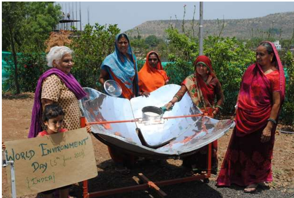
Women training women to use solar cookers, celebrating World Environment Day.