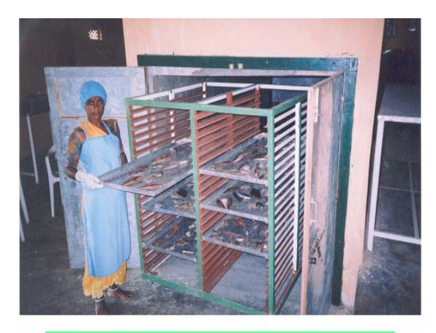
FISH DRIER AT M/S DFYWA, VISAG