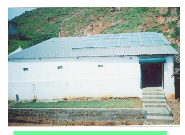
SOLDRY-FISH PROCESSING FACILITY PLANT, AT DFYWA, VISAKHAPATNAM