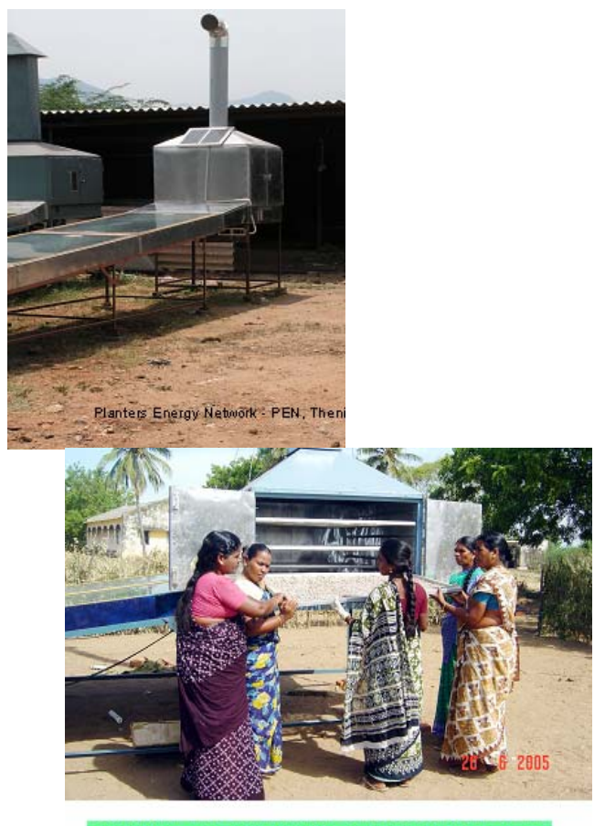
DRYING OF FISH USING SOLAR FISH DRIER