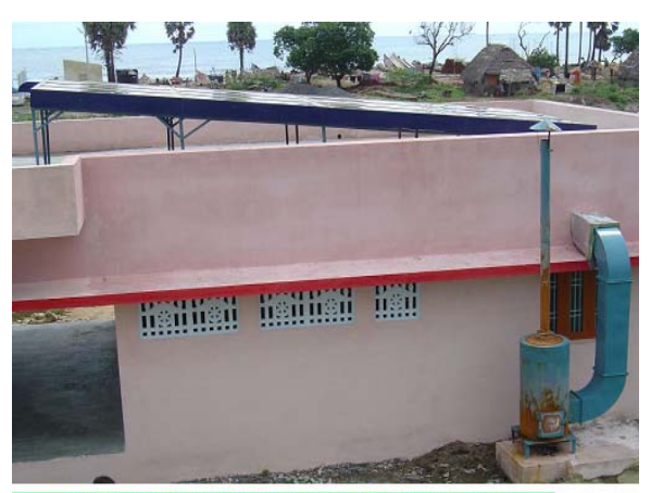
SOLAR FISH PROCESSIN PLANT AT POOMBUHAR, TAMILNADU