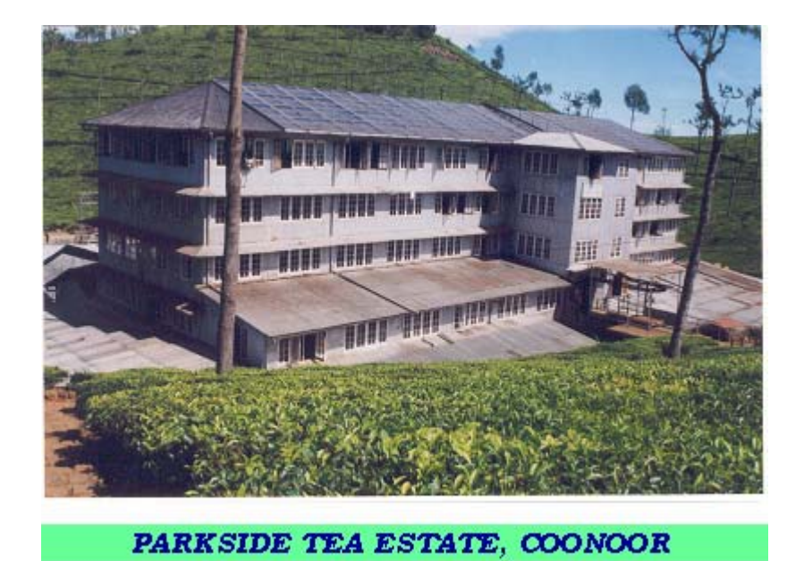
Unit after 15 years with repainting – 2007 December

Golden Hills 212 m<sup>2</sup> Installed In 1992