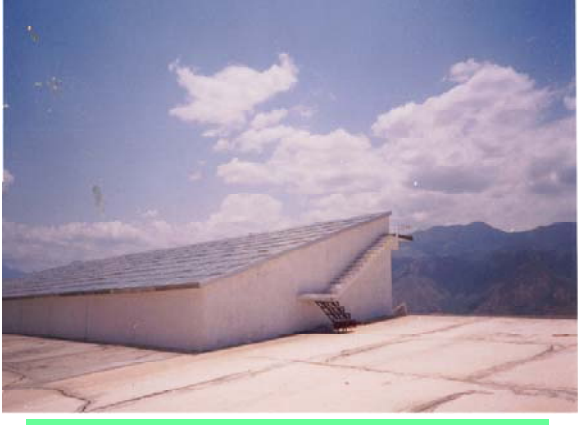
CHILLIES DRIER AT EASTERN CONDIMENTS, THENI