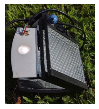
Figure 3: Functional small prototype with automatic tracking.

The optical system was simulated and optimized using Zemax OpticStudio, and a functional 1:15 scale prototype has been constructed. The prototype demonstrates a promising total optical efficiency of \approx 25\% (beam steering lens array efficiency \approx 60\% , reflector efficiency \approx 50\% , focusing error efficiency: \approx 80\% ). Total optical efficiency is expected to increase to 50%-60% using improved manufacturing methods. The lens array is expected to be compatible with injection molding, enabling low-cost high-volume production. By enabling low-cost automatic tracking, this technology may facilitate inexpensive, maintainable and user-friendly solar cooking, fostering its increased adoption across the world.