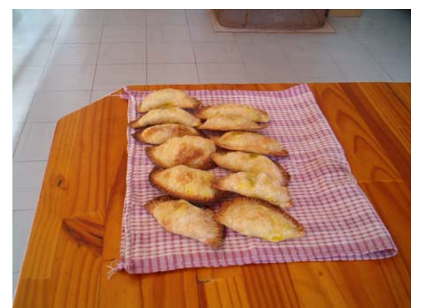
Fig. 6: Turnovers.