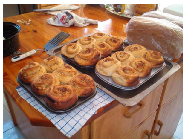
Fig. 8: Coffee/almond/coconut rolls.