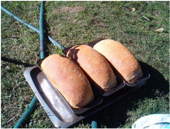
Fig. 4: Bread.