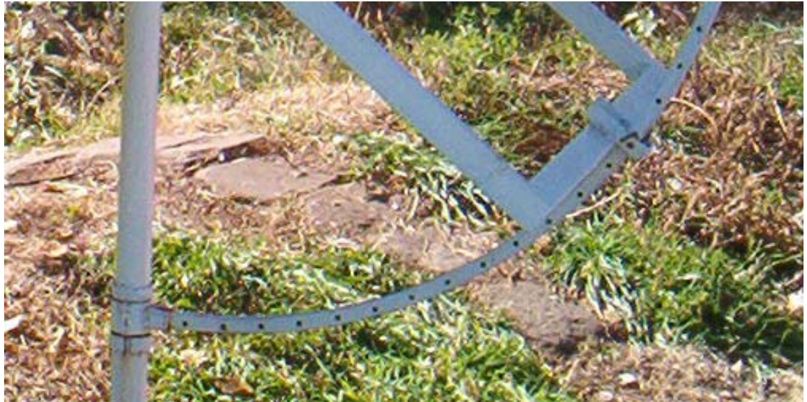
Fig. 11: Detail of altitude adjustment; note that radius arm is able to swivel on the vertical

support. Device is locked in place with a pin.