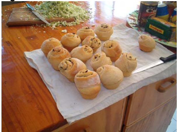
Fig. 9: Herb rolls with sun dried tomato.