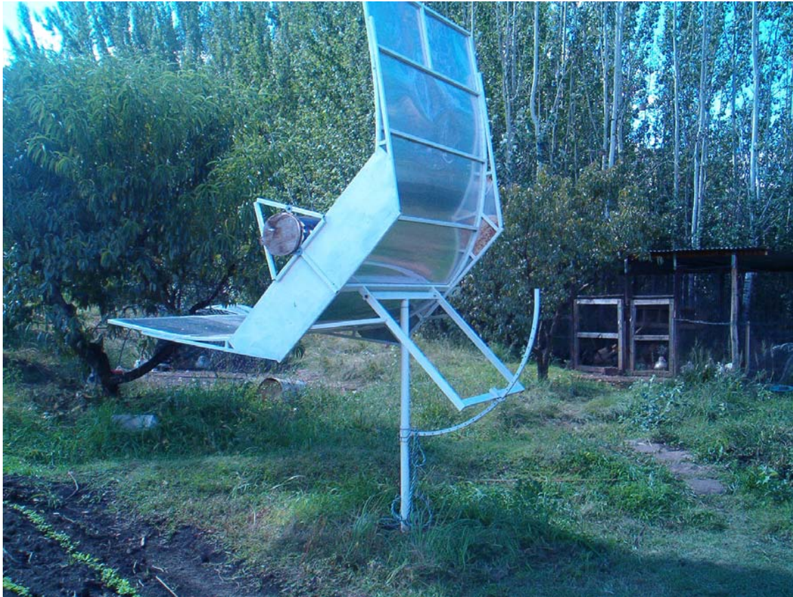
Fig. 2: View of device from rear, and illustrating dual axis tracking and adjustment.

Fig. 2. Neither of the pivot points requires precision engineering. The horizontal rotation "T" is a pipe in pipe swivel with a collar tack welded on, and the 2 vertical pivot points are just bolts with flat washers. While the oven must be manually actuated and adjusted (every 15 minutes), no mechanical or power driven devices are installed, which lowers the development costs and reduces maintenance problems. A small circular section of metal is allowed to protrude on one side of the trough. Aiming of the device is by means of checking on the shadow cast from the focus point on the ground (through the circular metal section) or on the circular metal section itself. Once the operator is accustomed to the fact that the shadow moves down in the morning and up in the afternoon (after the apparent altitude of the sun), it is relatively easy to keep the device focused and slightly ahead of the sun's position.