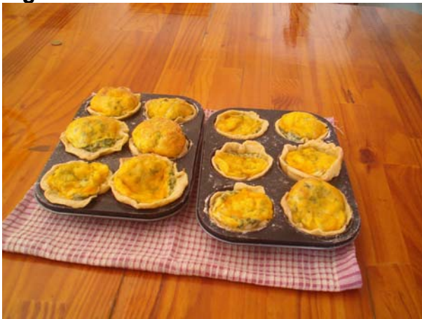
Fig. 7: Tarts.