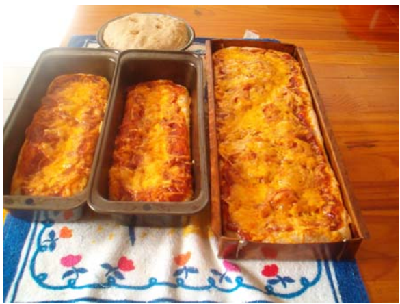
Fig. 5: Pizza.