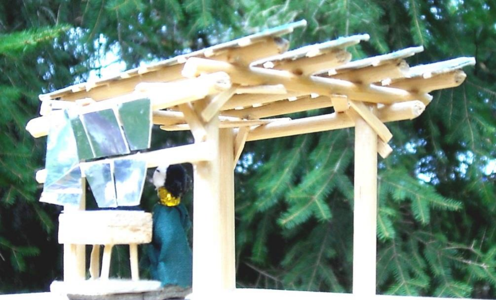
THRU-REFLECTOR-WALL for cooking PV Pergola JH Goodman