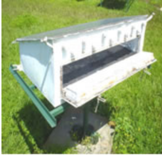
Fig. 11. Solar Oven cum Dryer .

The objective of these two multipurpose devices is not to perform two processes simultaneously - like cooking and heating water - but to use one at a time. In other words use for heating water (or drying), instead of cooking or after cooking is finished.