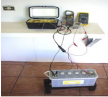
Fig. 7. Cooking from Solar charged Battery.