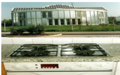
Fig. 9. Self sufficient solar house in Germany, with Solar/Hydrogen cooking.