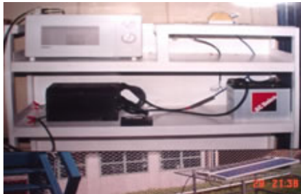
Fig. 8. Solar/ Electric Powered Microwave Oven at authors solar house.

Here solar cells are used to convert solar energy in DC electricity. This is then stored in specialized (deep cycle) batteries. The stored electricity is then converted to 110 VAC through an inverter, which can be used efficiently for running a conventional 110 VAC Microwave Oven. This could make sense for the remote places of rich and nature conserving persons. Photo 8 shows one of the system assembled, studied and used at our solar house.