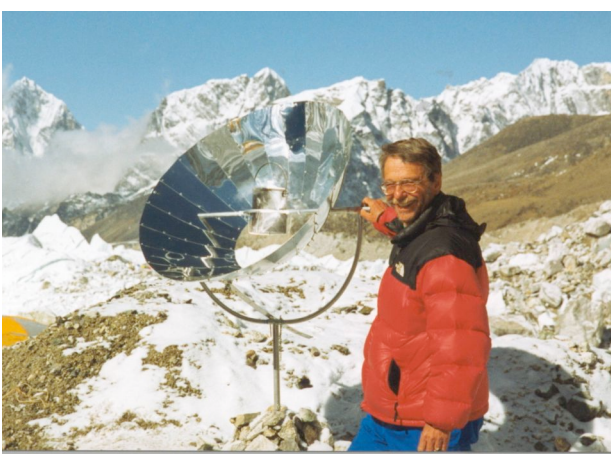
Fig.7 Parabolic "Sagarmatha" solar cooker at Everest base camp (made by FAST)

- I designed a powerful, collapsible, lightweight (3.5 kg) parabolic solar cooker for trekking agencies and households. In the year 2000, I installed this 1-meter diameter cooker at Everest Base Camp for use of the Everest 2000 Environmental Clean-up Expedition (fig.7). If trekking groups and expeditions would use solar and heat-retaining technologies, they would automatically disseminate solar cooking, providing a nice multiplier effect. Bringing lightweight collapsible parabolic cookers to households in remote villages reduces transportation costs. My design has been made available for free to reputable Nepalese organizations.