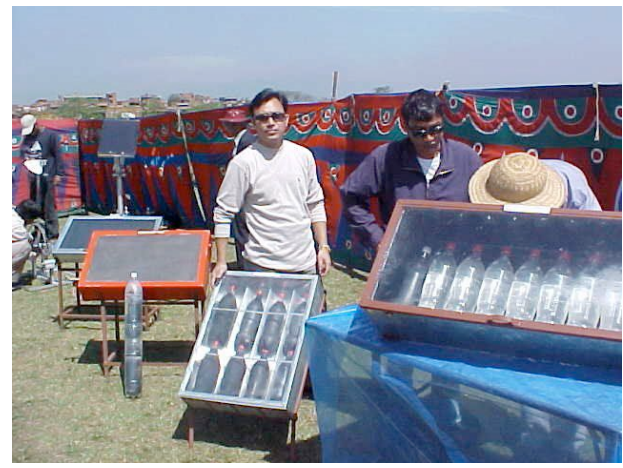
Fig.3 Water Pasteurizers - different types by FoST