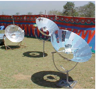
Fig. 10, 11, 12 Handing out solar and sustainable devices of Rotary Matching Grant projects

Where possible beneficiaries pay 15 percent of device costs to show a real commitment. Some projects also have an educational component of teaching schools how to make and use simple panel cookers. Another includes making bio-mass briquettes for fuel from any waste material (grass clippings, shredded leaves, newspapers, cardboard) in hand operated presses. Briquette programs empower women to become microentrepreneurs selling briquettes for use in efficient stoves. I selected FoST as the primary organization responsible for training of the villagers, fabricating the devices and coordinating with Village Development Committees and Rotary. When I am not in Nepal, we communicate through e-mail.