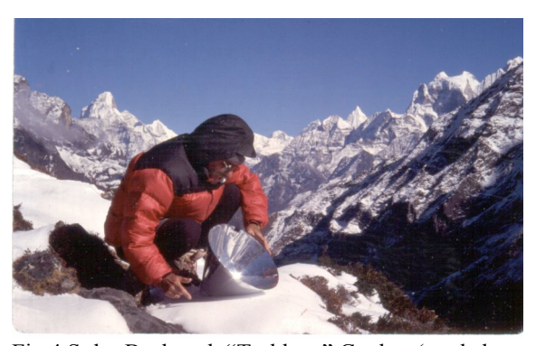
Fig.4 Solar Backpack "Trekkers" Cooker (made by FAST) preparing food or melting snow for drinking