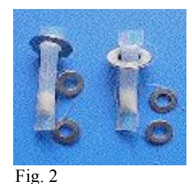
Water Pasteurization Indicator. WAPI's made in Nepal