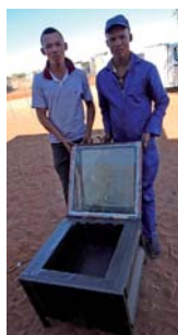
Taking action! After their visit to NaDEET Centre last year, these young men went home and constructed their own solar oven with locally sourced materials.