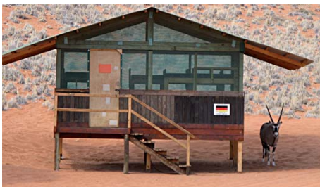
This curious Oryx started taking over perfect shady spots around and even under the Centre houses.