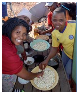
Producing popcorn as a healthy alternative and a great business idea.

This year's youth programmes included an exciting new activity on developing self-employment that is also environmentally friendly. The activity was based on four employment areas of produce, fix, grow and sell. Youth were given the option to choose the area they were most interested in to develop business plans and try out practical examples.