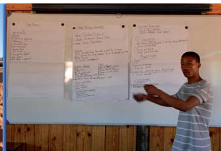
Presenting business plans for marketing and selling products.

NaDEET has been very educational. It has brought me closer to the environment, rather changed the way I think about the environment. It taught me the impacts my actions have on the environment. I can be responsible and take action to save the world.