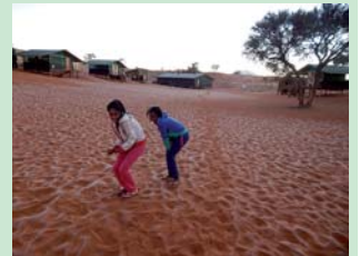
Stampriet learners shivering on frost covered dunes in July.