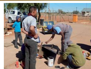
Constructing the solar ovens in Gochas in the school yard.

A major outcome of the RUG for Sustainability action is to improve access to sustainable living equipment. This year, in addition to our community group programme, we trained RUG communities in solar oven construction together with the support of Namibian solar oven producer, Nailoke's Solar House. Interested men and women in each community made two goat-sized solar ovens that were donated to the schools and hostels for use at the schools for education purposes and as an alternative cooking method.