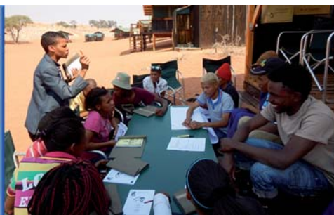
Business plan development to provide repair services.