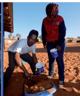
Preparing soil for growing food as a source of income.