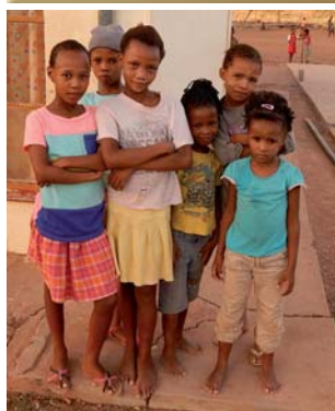
Uibes kids waiting for breakfast.

A major outcome of the RUG for Sustainability action is to improve access to sustainable living equipment. This year, in addition to our community group programme, we trained RUG communities in solar oven construction together with the support of Namibian solar oven producer, Nailoke's Solar House. Interested men and women in each community made two goat-sized solar ovens that were donated to the schools and hostels for use at the schools for education purposes and as an alternative cooking method.