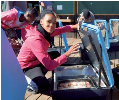
Oanob PS learner solar-cooking meatballs.