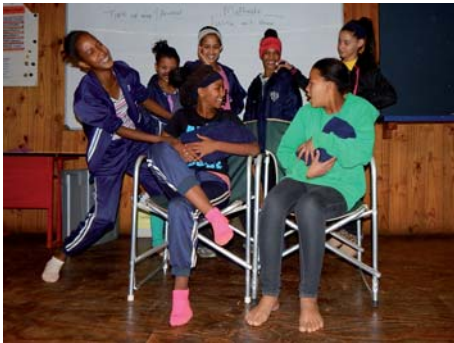
St Joseph's learners acting out overpopulation.