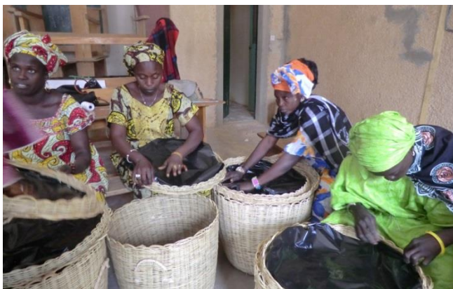
Production of hay baskets in Ndondol, Senegal

In order to improve the living standards of women, we support local ISC/CSI initiatives in which women can participate fully, improve their position, generate income and take part in the local economy. Women have hands-on experience in cooking and daily activities; indeed it makes them excellent marketers, promoters and instructors.