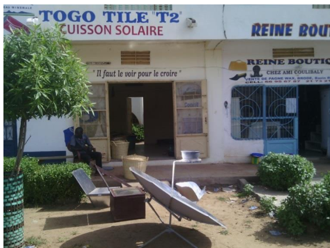
One of Togo Tilé's outlets in Ségou