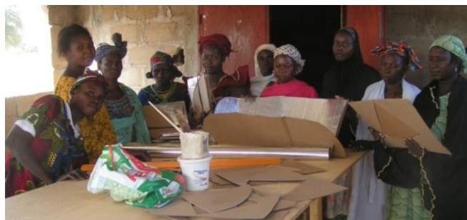
The five Bella women (right) in the Togo Tilé workshop