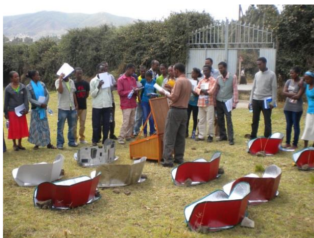
Solar cooking training session in Ethiopia

For the Solar Cooking KoZon Foundation's complete Vision and Objectives, see our website www.solarcookingkozon.nl