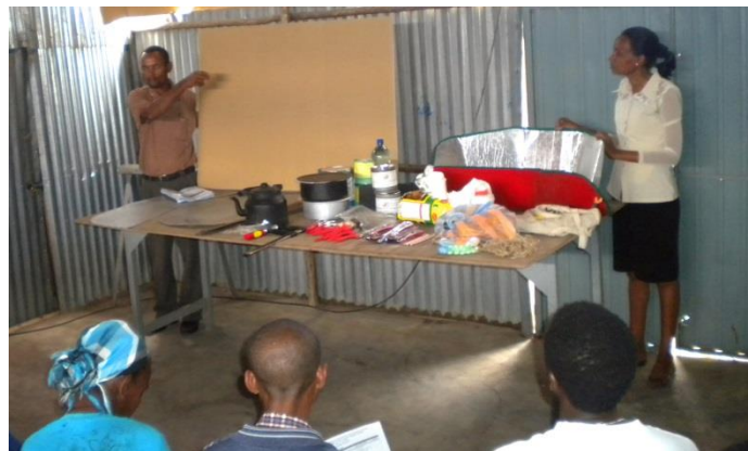
ISC information and promotion in Ethiopia

built in six provinces across Ethiopia. Production and distribution (sale) of solar, biogas and wood-saving cooking appliances started at the end of 2015. In 2014 and 2015 large-scale public promotion and training of local employees took place.