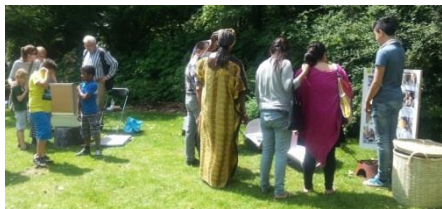
Belmondo Festival in Wageningen

KoZon could again count on the support of many faithful donors. Thank so much for that. KoZon received the end-of-year 'Tintelingen' of 1,950 Euro from Wageningen University and Research Centre (WUR). The money has been spent on a project for handicapped men and women. Rotary Club Wageningen has undertaken to give us 1,000 Euro, which is part of the proceeds of Rotary on Wheels event where KoZon had a booth. To both organisations thank you very much!