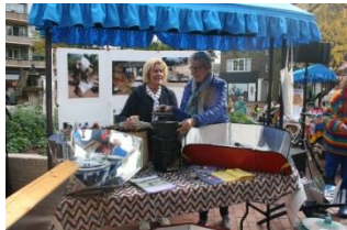
At the World Shop in Bussum