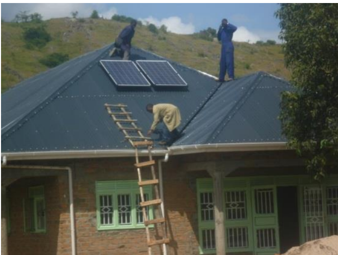
The new Renewable Energy Centre near Mbarara

Mid-2013 a business plan was decided on, including a schedule of ISC activities during the following five years. In the course of 2014 it became clear that the objective of financial independence had been achieved. The business expanded from Mbarara in the South West to the poorer outskirts of and villages around Kampala. For the time being production continues in Mbarara only. In 2014 construction of a Renewable Energy Centre with larger ISC production, training and distribution facilities was started with financial support from Wilde Ganzen and SCN. In its beautiful location on the main road between Uganda, The Congo, Tanzania and Rwanda, the building, fitted out with solar panels, is ready to continue and expand its activities. In short, SCA is the owner of a social Solar Cooking business for the production, marketing and sale of solar and other energy-saving cooking appliances.