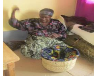
8. Sewing material on basket