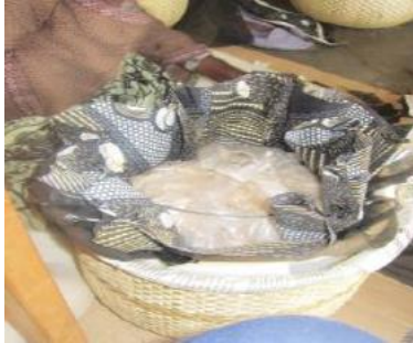
7. Cut cotton clothe + plastic