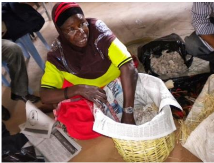
1. Newspaper in basket