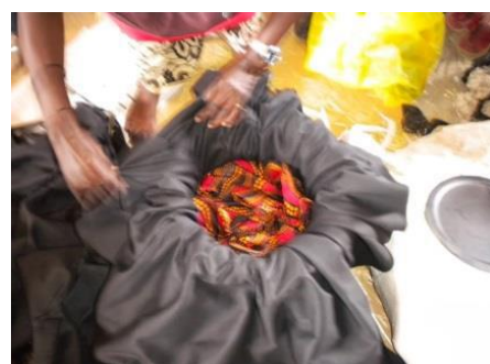
6. Plastic + cotton