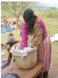
4. Put sponge inside