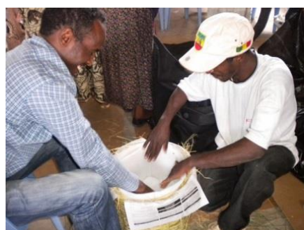
5. Sponge at the bottom