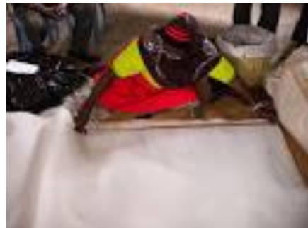
3. Measure spongo