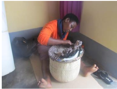
8. Sewing material on basket