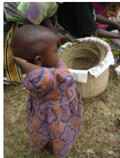
2. Dried grass