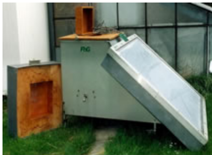
Fig. 5. Long term heat storage cooker using oil (Germany, 1986)

The author has studied these aspects through the storage of heat in the form of both sensible (firebricks) and latent (High Density Plastic, Vestolene and Mg NO 3 ). From these and other studies it can be concluded that food could not be cooked with stored heat, but it could be kept hot for a few hours. Some more work is needed to make this oven more practical.