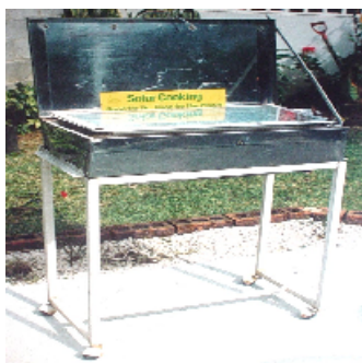
Fig. 1. Solar Oven Constructed in 1980 and still in use by authors family.

In our particular model (Fig. 1), the maximum plate/air temperature reached about 150° C, without any food or load inside and between 110- 130 °C while cooking. The food could be cooked in 1-3 hours. We got a patent on this Solar Oven in Costa Rica in 1984.