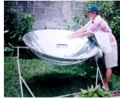
Fig. 2. Solar Concentrating Cooker (type SK14)