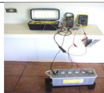
Fig. 7. Cooking from Solar charged Battery.

Here the electricity generated from solar cells is stored in the battery and then is used for cooking. The Figure 7 shows one of this model studied by the author.