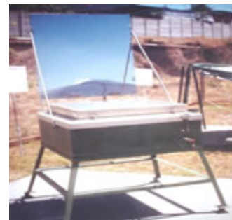
Fig. 10. Solar Oven cum Water Heater.

It is similar to conventional hot box with basically two changes. The transparent glass covers are not flat but inclined by 15-20° C, and secondly there are some holes in the front of the box (for the entrance of fresh/ ambient air) and some holes on the back of the box and at higher level (as compared to the front side), for the exit of humid air. The holes could be closed (for cooking) or opened (for drying) as required. One of the models designed and studied by the author is shown in the Fig. 11.