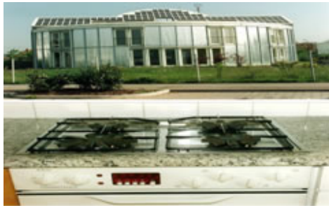
Fig. 9. Self sufficient solar house in Germany, with Solar/Hydrogen cooking.