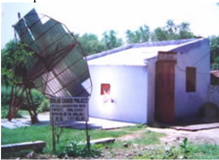
Figures 3b . Cooking inside the house transporting solar energy .

In Figure 3b, again a cooker for a school, in India, one big concentrator of 7 m 2 is used with a set of acrylic reflecting mirrors. It produces around 450 °C, at the focal point (window) and is designed to cook for 60- 80 persons. In this case the concentrator is moved automatically to keep the focal point at a fixed place.