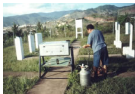
Fig. 4. Hybrid Solar Oven , with 110 VAC Electricity in Costa Rica (a, upper) and with LPG in Honduras (b, lower).