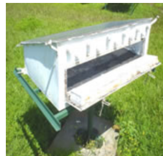
Fig. 11. Solar Oven cum Dryer .