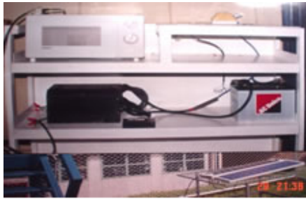
Fig. 8. Solar/ Electric Powered Microwave Oven at authors solar house.

Here solar cells are used to convert solar energy in DC electricity. This is then stored in specialized (deep cycle) batteries. The stored electricity is then converted to 110 VAC through an inverter, which can be used efficiently for running a conventional 110 VAC Microwave Oven. This could make sense for the remote places of rich and nature conserving persons. Photo 8 shows one of the system assembled, studied and used at our solar house.