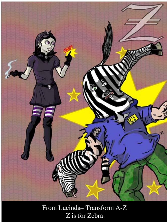
From Lucinda- Transform A-Z Z is for Zebra

Lucinda can turn anyone or anything into whatever she likes and does so often and with delight.