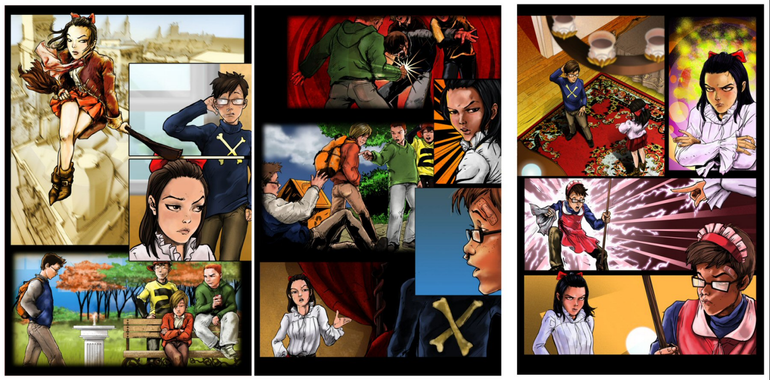
Lucinda from witch girls adventures.